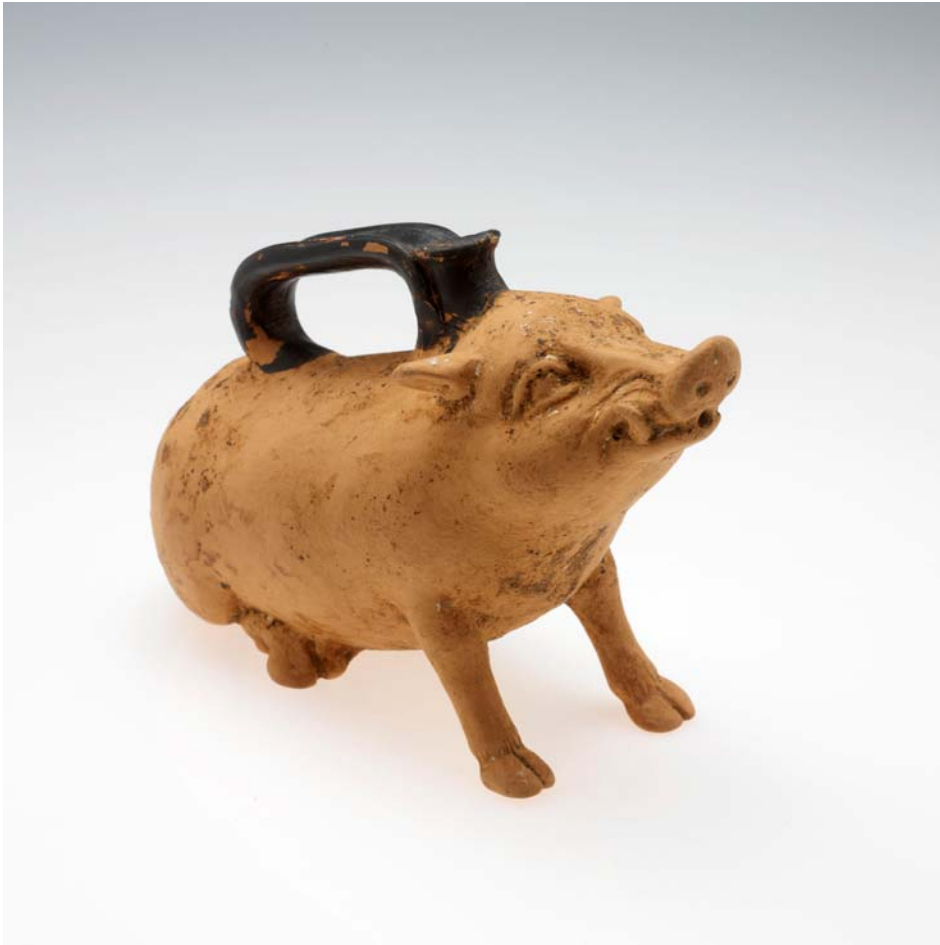
Greek, Apulia, South Italy Oil container ( askos ) in the form of a boar, late 4th-early 3rd century BCE Georgianna Sayles Aldrich Fund 1996.98