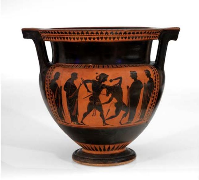
Greek, Attica, Mixing vessel (krater) , 520-510 BCE Side A: Herakles with Iolaos, Athena, Dionysos and Apollo Side B: Theseus and the Minotaur Museum Appropriation Fund 29.140