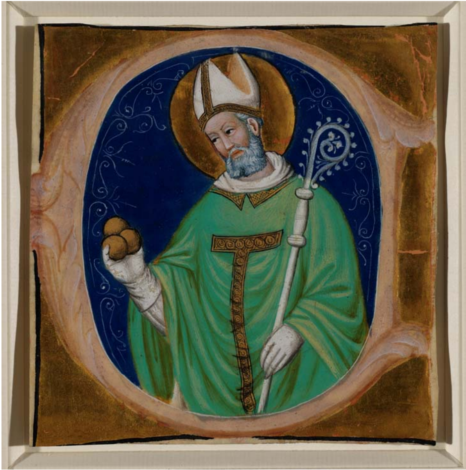
Master of the Brussels Initials Saint Nicolas , ca. 1410-20 Mary B. Jackson Fund 2010.19.2