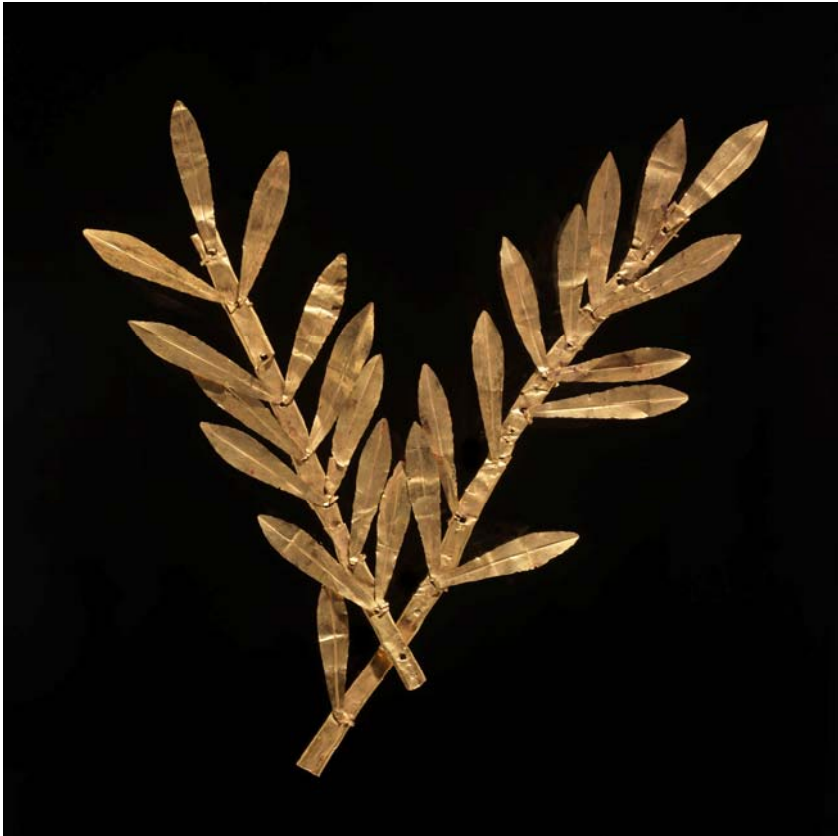
Roman Funerary wreath , 4th century CE Museum Appropriation Fund 32.007