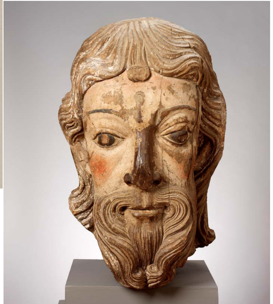
Spanish Head of Christ or a Saint , ca 1220-1240 Museum purchase 59.131