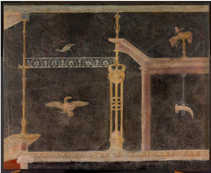
Roman Fragment of a black wall , 14-37 CE Museum Appropriation Fund 38.058.2c