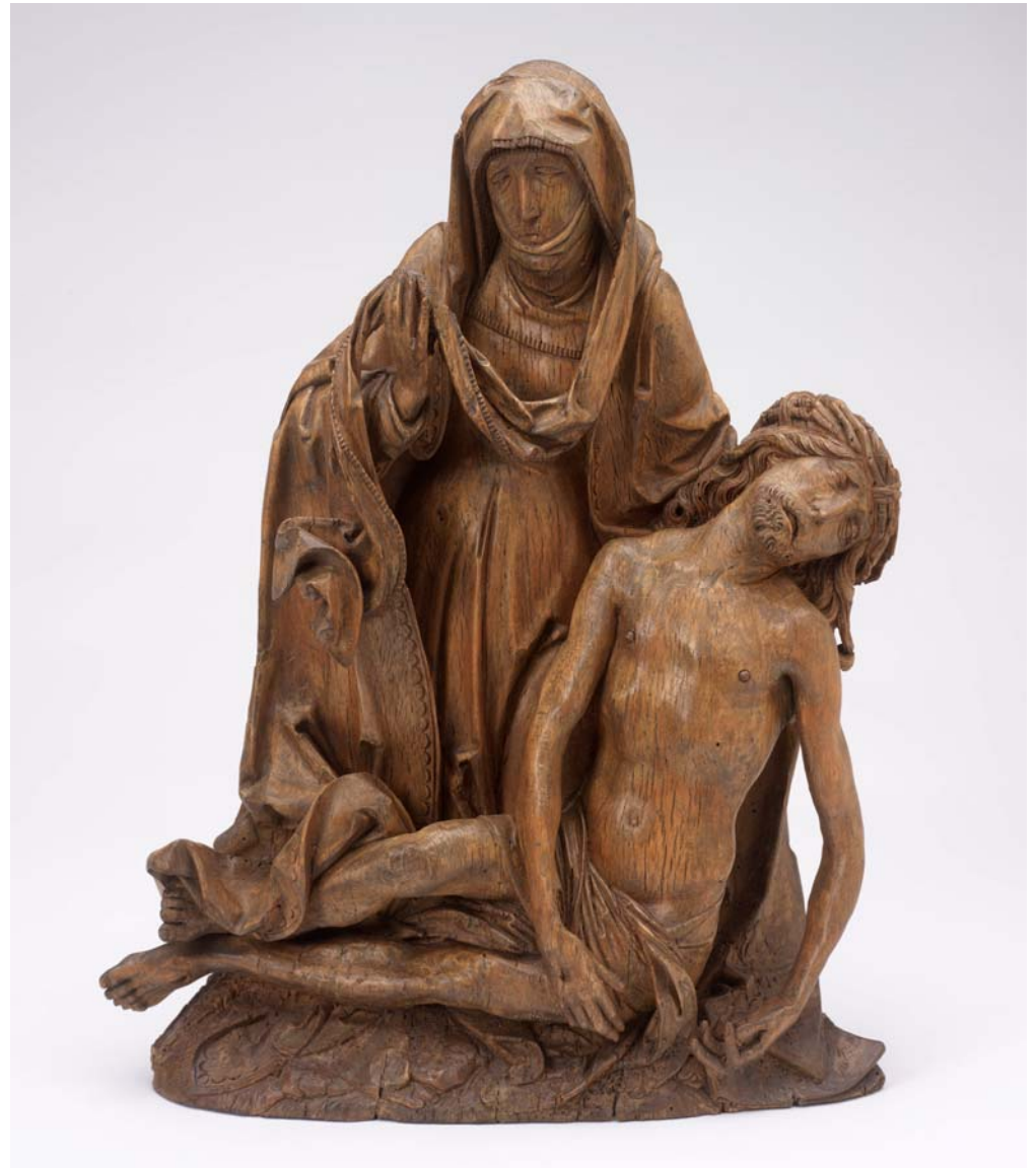
Tilman Riemenschneider Pietà , ca. 1515-1525 Museum Works of Art Fund 59.128