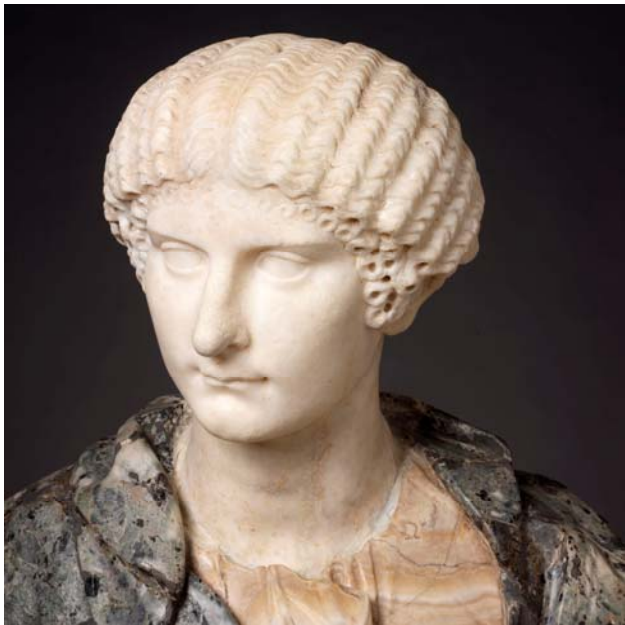
Roman, Portrait of Agrippina the Younger , ca. 40 CE Anonymous Gift 56.097

On September 24, the Museum will reveal its latest major renovation and reinstallation: the Ancient, Medieval, and Early Renaissance galleries. These spaces, located in the 1926 Radeke Building, have been fully restored and reinterpreted in new ways. The Museum's ancient collection—one of the finest collections of any university museum in the country—includes exceptional bronze and coin holdings, stone sculpture, vases, Roman paintings and mosaics, an impressive jewelry collection, and fine teaching examples of terracotta and glass. The Museum's fine Medieval and Gothic holdings include a 12th-century stone sculpture of St. Peter from the Third Abbey Church of Cluny, a massive Romanesque stone archway, delicately carved ivory panels, and a rare polychromed wooden statue of the Angel Gabriel from Tuscany.