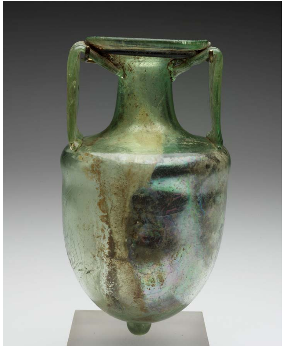
Roman Pointed amphora , 3rd-4th century CE Helen M. Danforth Acquisition Fund 2008.1