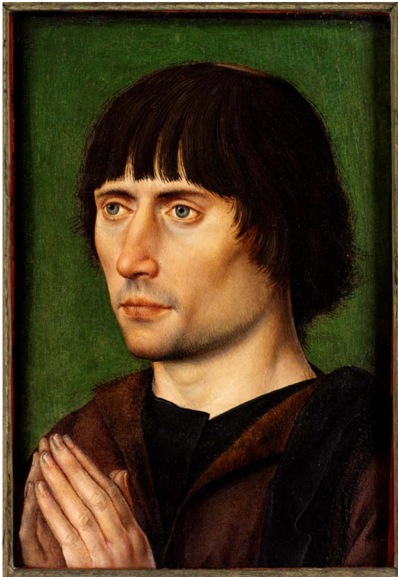
Bruges Master Portrait of a Cleric , ca. 1490 Museum purchase with funds from Mrs. Gustav Radeke, Manton B. Metcalf, Museum Works of Art Fund and Museum Appropriation Fund, by exchange, and Museum Special Reserve Fund 45.042