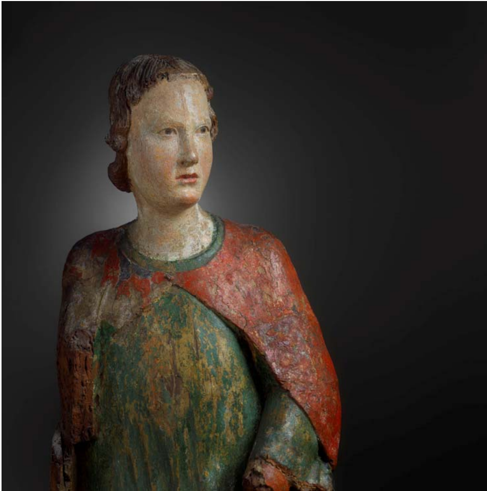
Italian (Siena or Pisa) Angel of the Annunciation , ca. 1350 Museum Appropriation Fund 37.114