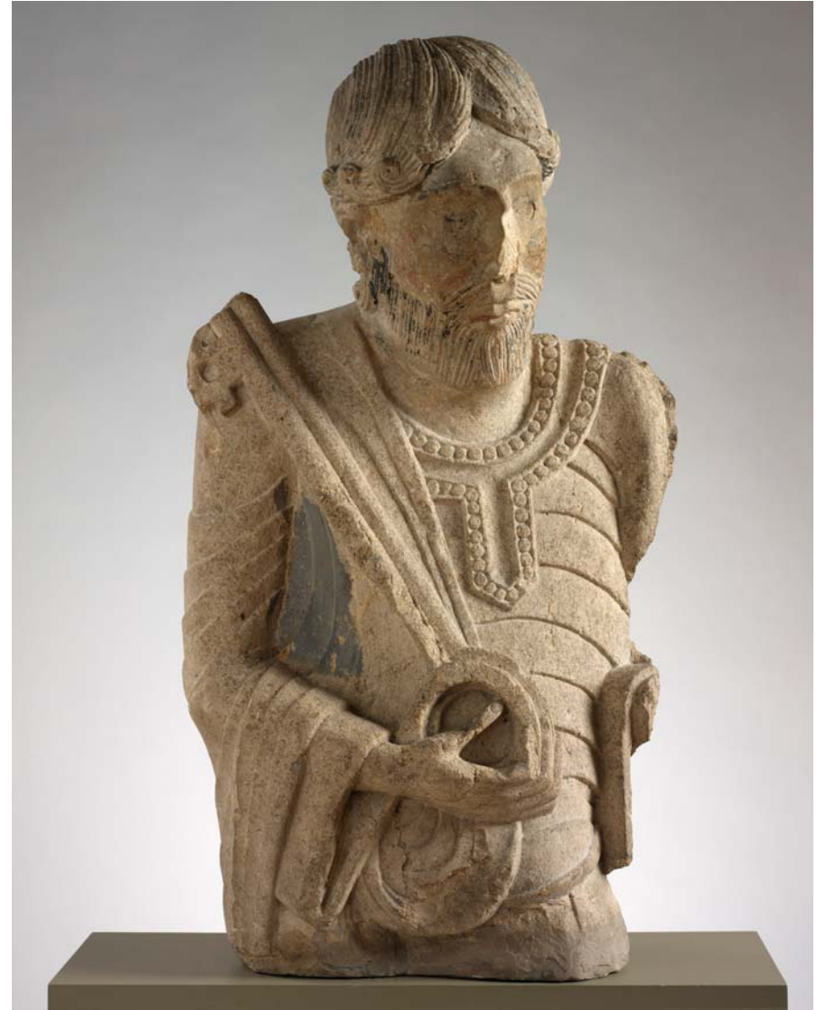
French (Burgundy) Saint Peter , early 12th century Museum Appropriation Fund 20.254