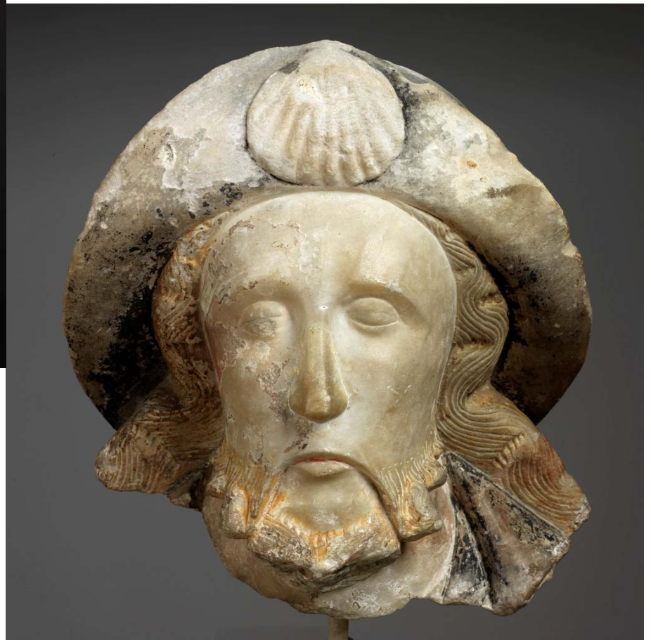
English St. James the Great , 15th century Museum Appropriation Fund 25.144