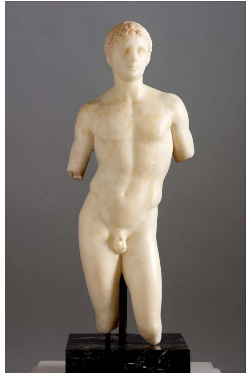
Greek, Knidos Male figure (Bebenburg Youth) , 3rd century BCE Museum Appropriation Fund and Special Gift Fund 23.342