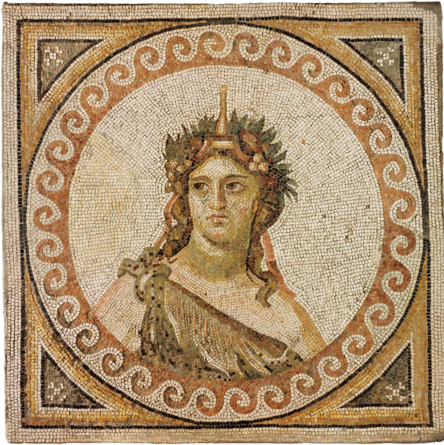
Roman, from a villa at Daphne near Antioch (modern Antakya, Turkey) Bacchus , 325-330 CE Acquired by exchange from Worcester Art Museum 40.195