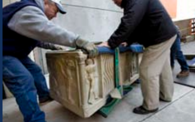
Above: Workers move the sarcophagus from the Roger Williams Park Museum of Natural History to The RISD Museum.