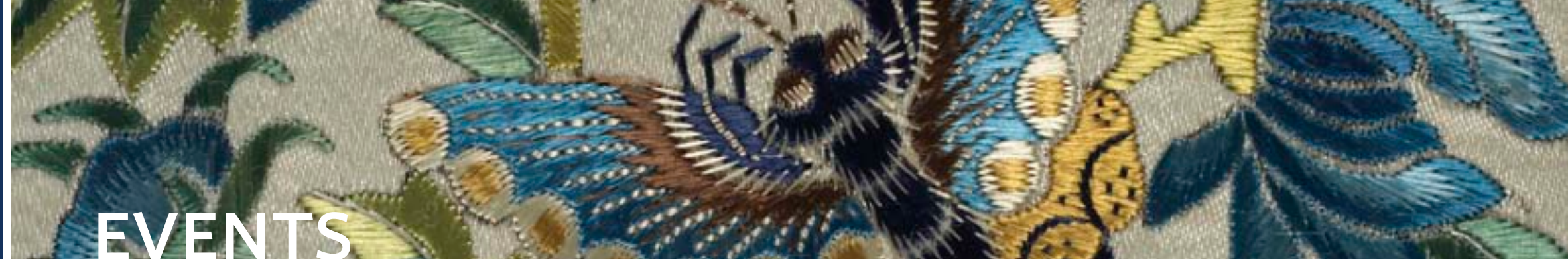
Above: Chinese, sleeve band (detail), 19th century. On view in Queen of the Insects . Gift of Miss Lucy T. Aldrich.