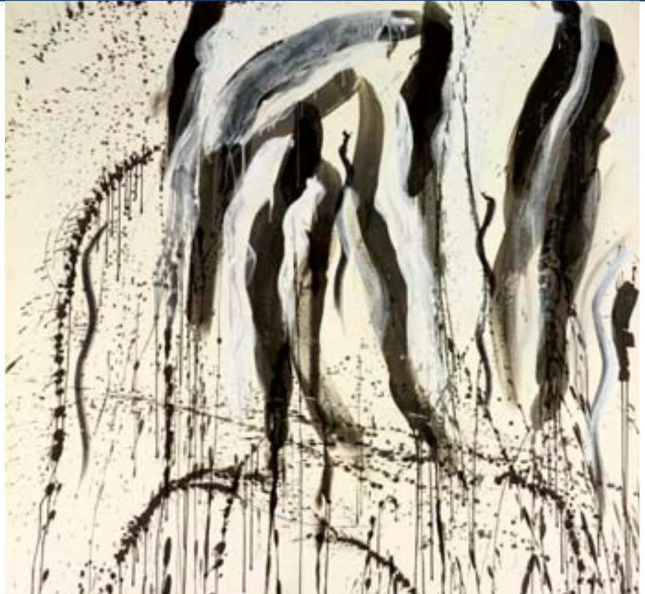
Pat Steir, The Austria Group. No. 2, 1991.

Visitors entering the main exhibition space will first encounter Steir's quiet, early works. Having written poetry before learning to paint, Steir considers drawing and writing as one and the same. In 1975, Steir narrowed her research