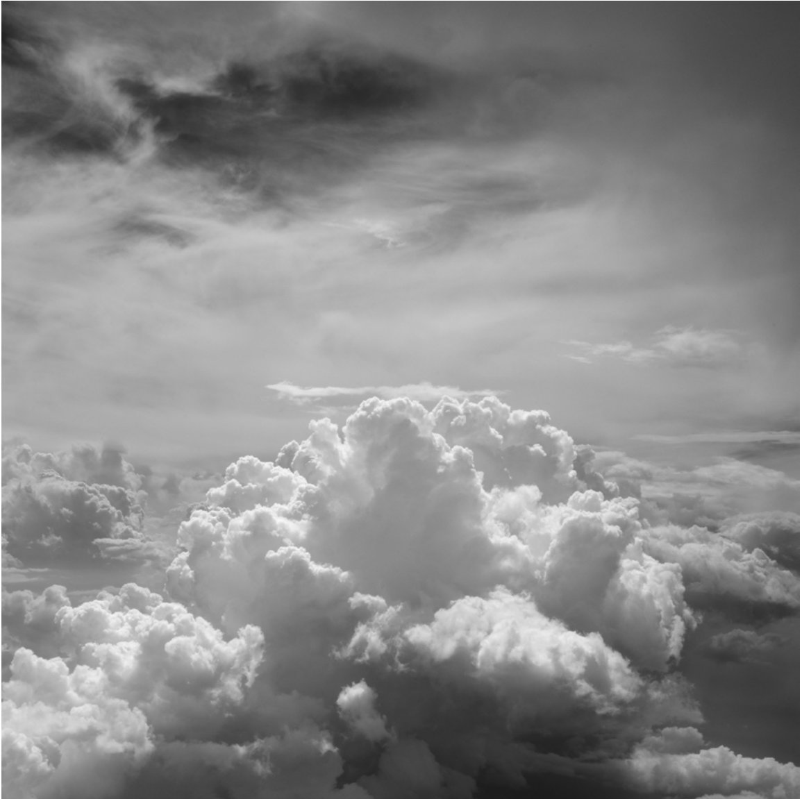
5. Matthew Clowney, Photography faculty Title: 33deg 28 '10"x86deg 59' 1" Medium: Archival inkjet print