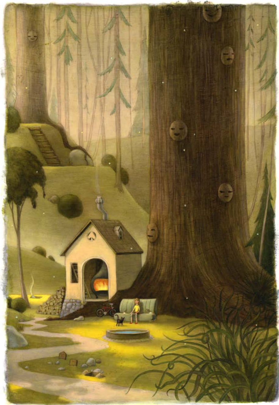
8. Kelly Murphy, Illustration faculty Title: Fairbanks Medium: Oil, acrylic, gel medium on paper