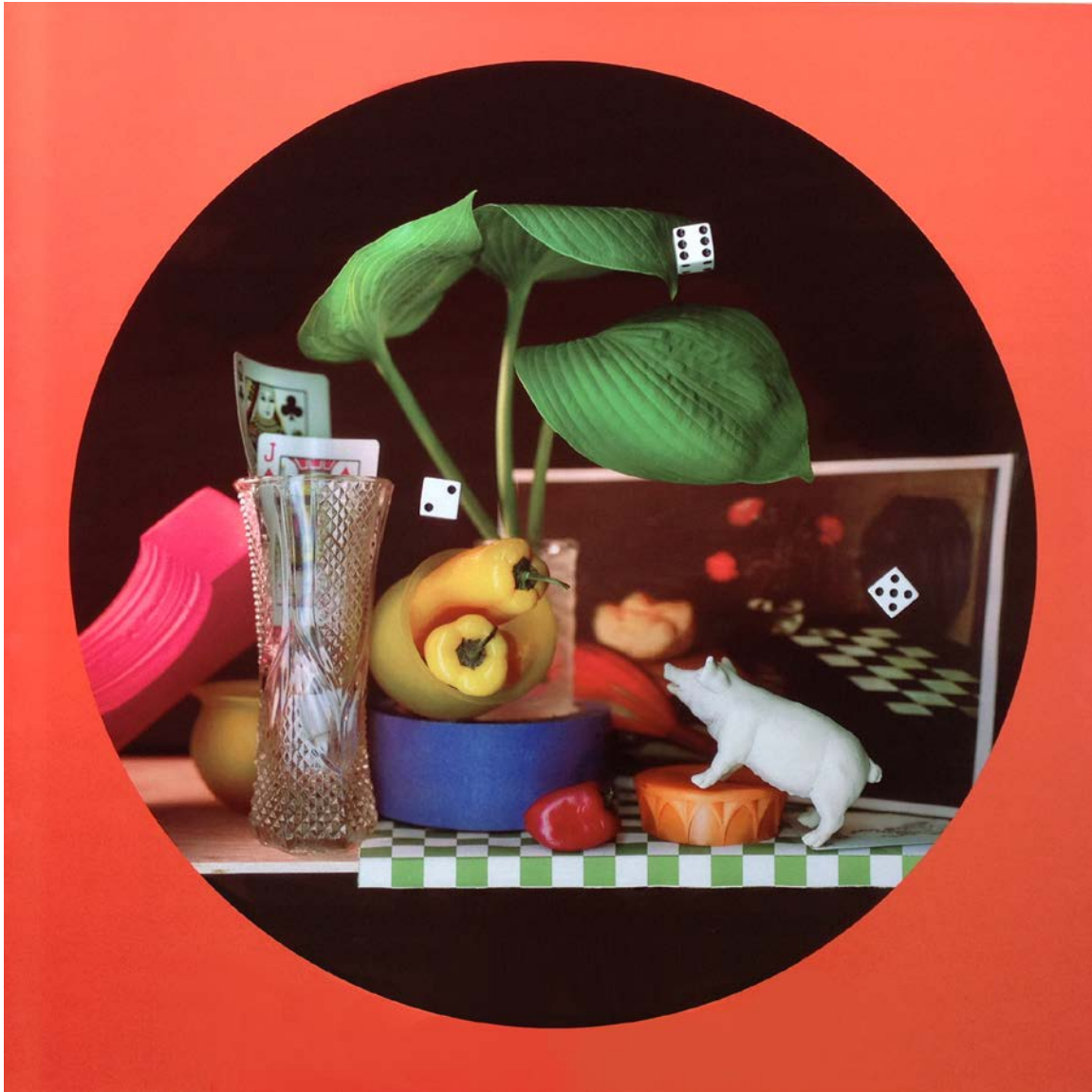
1. Kate Blacklock, Industrial Design faculty Title: Primary Medium: Dye infused aluminum